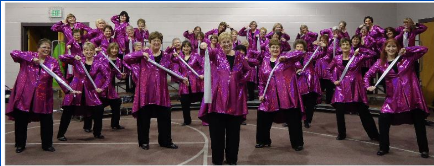
Nebraska Pride Chorus-Can It Really Be 20 Years?