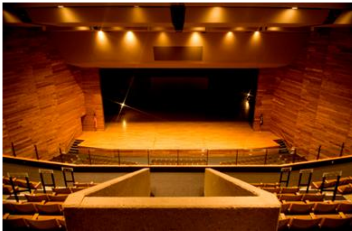
View of the Cheyenne Civic Center Stage from the balcony.

Adelines International has 21,856 members in 18 countries around the world!